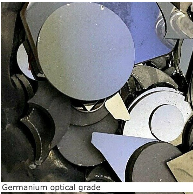
Germanium optical grade